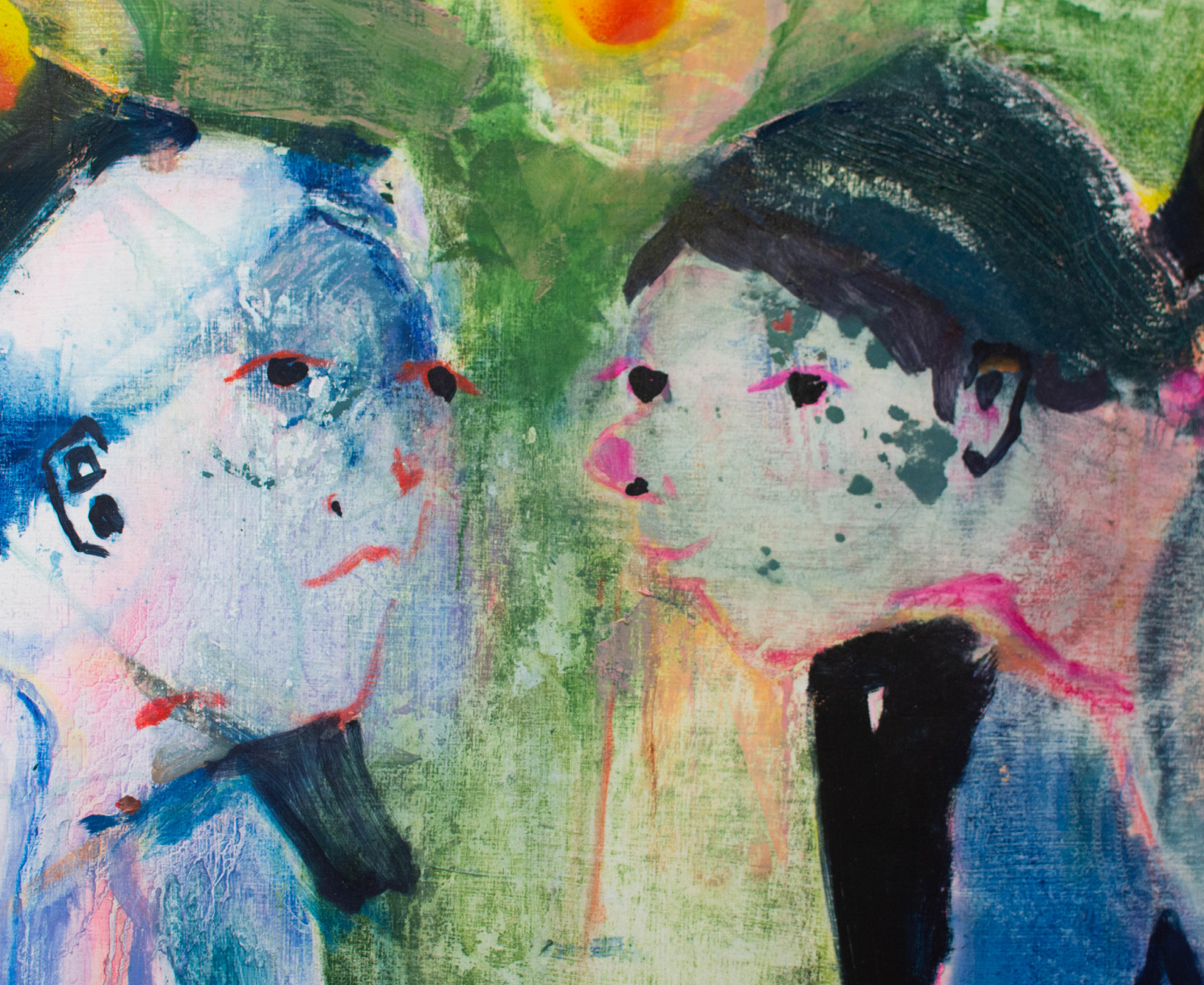
Image: Detail from "bottomfeeders" by Madeline Norton. This work was on view in "WHAT'S THE SECRET?"