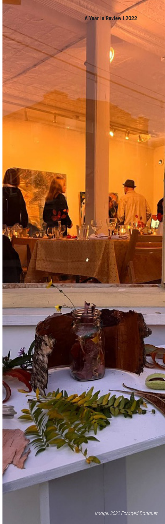
Image: 2022 Foraged Banquet

In June, Gallery 263 celebrated its 14th birthday with the first-ever Birthday Bash. Many new friends learned about the gallery at the party, and old friends—including Cambridgeport neighbors—enjoyed the festivities.