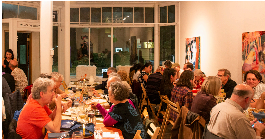
Image: The first Foraged Banquet since the event was put on pause due to the pandemic. This pictured event was held in October. Ticket sales of Foraged Banquets support gallery operating costs.